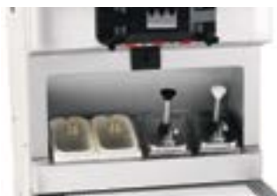
Integrated Syrup Rail Option 2 room temperature with lids and ladles, 2 heated with syrup pumps