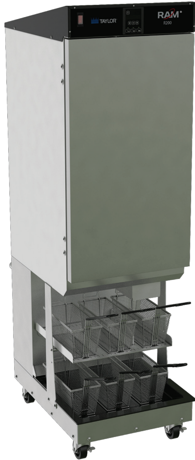
Fryer Baskets Sold Separately