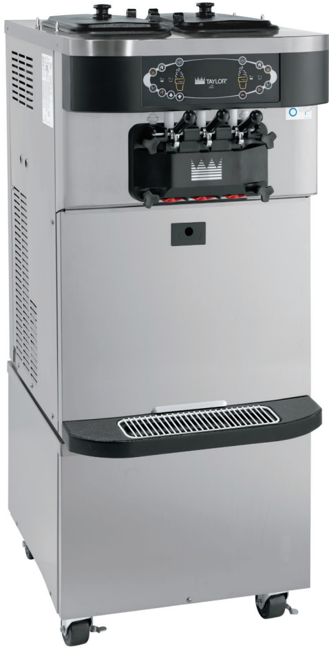
Shown with optional ADA cart