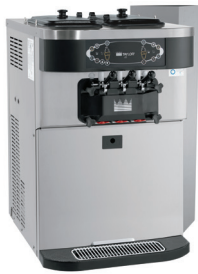
Shown with optional top air discharge chute