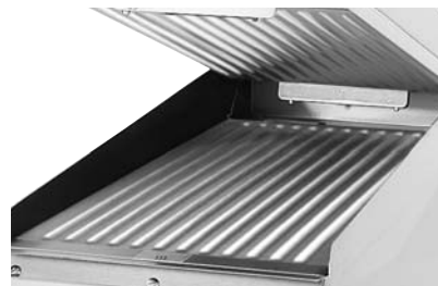
Available with optional grooved lower cooking surface and/or grooved upper platen