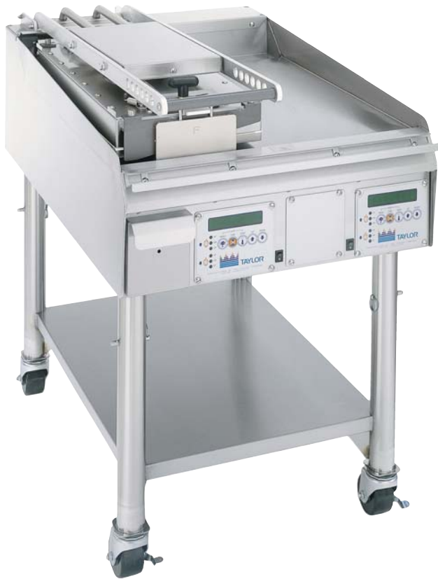
Shown with optional cart