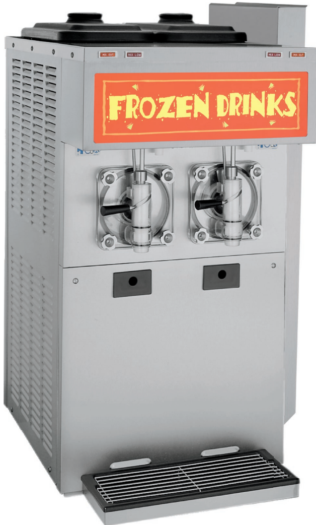
Shown with optional top air discharge chute

Self-merchandising lighted display backlights the static cling flavor card and downlights the dispensing door. Five static clings are provided: Frozen Cappuccino, Frozen Cocktails, Frozen Drinks, Shakes, and Smoothies.